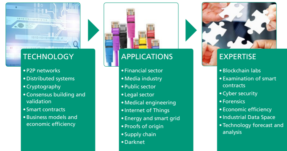
Fig. 1: Technology, applications and competencies from the point of view of the Fraunhofer-Gesellschaft

This position paper analyzes blockchain technology from the scientific and application-oriented perspective of the Fraunhofer-Gesellschaft. It examines relevant technical aspects and related research questions. It shows that technology still has fundamental research and development challenges in all areas. These include, for example, the modularization of individual blockchain concepts as well as their combination and integration for application-specific blockchain solutions.