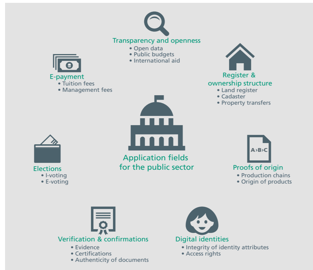
Fig. 3: Application fields of blockchain technology which are frequently discussed on the international level [17]

technology 10 for several years. Since 2015, the country has also been offering a blockchain-based emergency service with its e-residency program. In addition to Estonia, many other countries are working intensively on the technology and developing strategies for using blockchain in administration, including the United Kingdom, Dubai and the United States. In the process, a variety of application scenarios are being discussed.